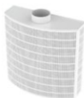
DVBC Curved Face Diffuser for Wall Mount Applications