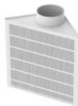
DVC1 Flat Face Diffuser with 90 Degree Air Discharge Pattern for Corner Mount Applications