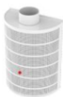
DV180 Semi-Circular Displacement Diffuser with 180 Degree Air Discharge Pattern

Energy Efficiency: These systems use warmer supply air and lower pressures , resulting in significant energy savings. The design also allows for more free cooling days by utilizing outside air. This is similar to underfloor systems but with enhanced efficiency.